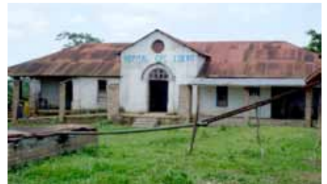
Hospital CPC Luebo

We returned two days ago from our final visit sore, exhausted and plagued by "traveler's diarrhea" but excited about the coming months when we will return to these stations on a regular schedule. John will do and teach surgery (and try to fix an ailing generator, a broken water pump, a defunct solar power system...). I will work in the schools helping teachers and administrators find ways to improve the quality of instruction and increase community involvement.