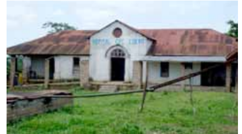
Hospital CPC Luebo